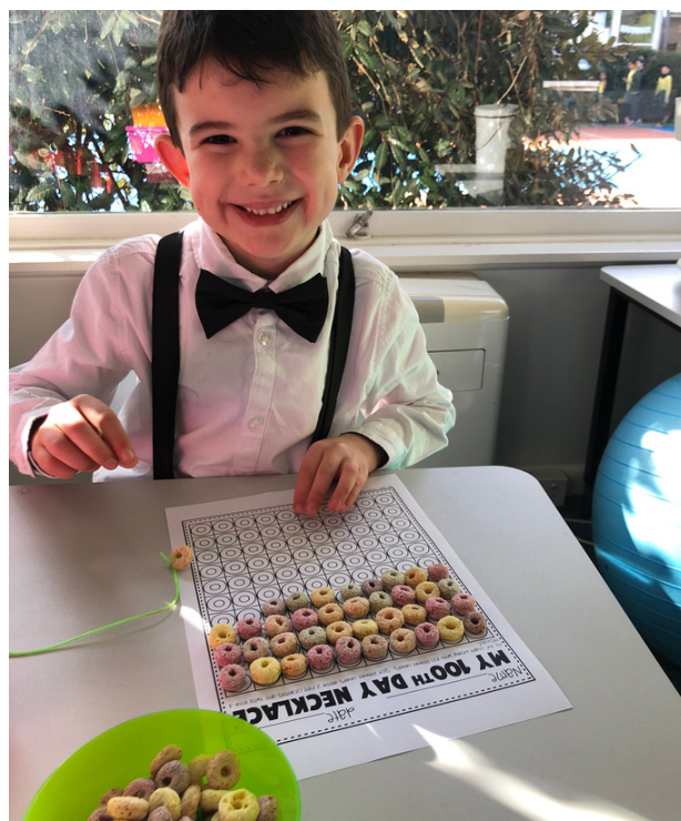
100 Days of School! Dressed up as 100 year olds, our students completed various games and activities to practice number recognition to 100!

Throughout the year, students are exposed to a range of activities and lessons that develop a strong 'number sense' using a variety of mathematical tools such as ten frames, number lines and hundreds charts. Each day, students will count the number of days they have been at school up to 100. This daily activity helps students to conceptualise and visualise numbers up to 100. It allows them to recognise patterns in counting and truly understand what it means to be 'x' number. On the final day we celebrate 100 days of school with lots of counting games and fun activities.