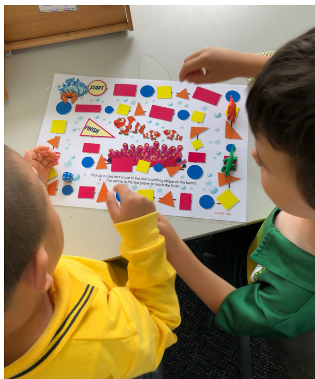
Foundation students playing The Shape Game and naming features of each shape they land on.